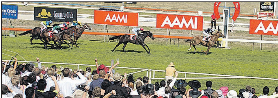
ACROSS THE LINE: Ista Kareem wins from Lady Atire and Our Dashing Dane.